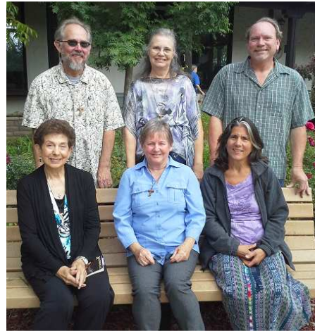
San Damiano Sept. 26-28, 2014 Franciscan Spirituality Retreat