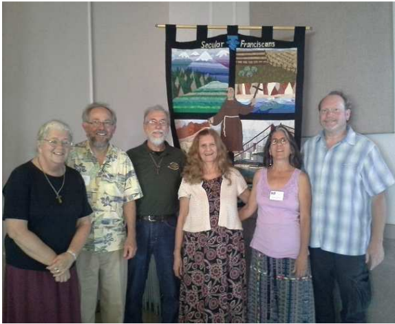
Franciscan Family Gathering Sept. 20, 2014