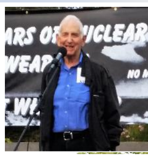
Keynote speaker, Daniel Ellsberg