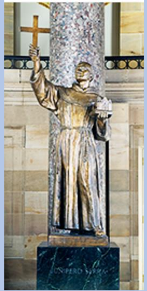
Blessed Junípero Serra. Sculpture in The National Statuary Hall