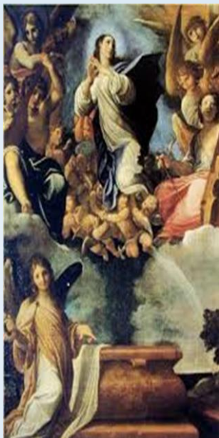
Feast of the Assumption of Our Lady August 15 th

My soul magnifies the Lord And my spirit rejoices in God my Savior; Because He has regarded the lowliness of His handmaid; For behold, henceforth all generations shall call me blessed; Because He who is mighty has done great things for me, and holy is His name; And His mercy is from generation to generation on those who fear Him. He has shown might with His arm, He has scattered the proud in the conceit of their heart. He has put down the mighty from their thrones, and has exalted the lowly. He has filled the hungry with good things, and the rich He has sent away empty. He has given help to Israel, his servant, mindful of His mercy Even as he spoke to our fathers, to Abraham and to his posterity forever.