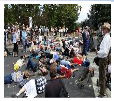
Die In at front gates of LLL

Pope marks Hiroshima anniversary by calling for nuclear weapons ban: http://wp.me/p5DZKA-v4