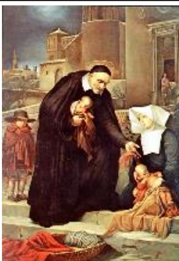
St. Vincent de Paul pray for us

"Charity is certainly greater than any rule. Moreover, all rules must lead to charity."