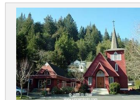
St. Philip the Apostle Church