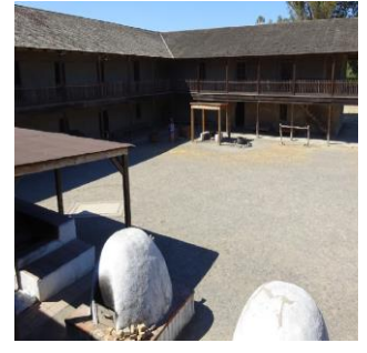
Courtyard of Old Adobe, Petaluma