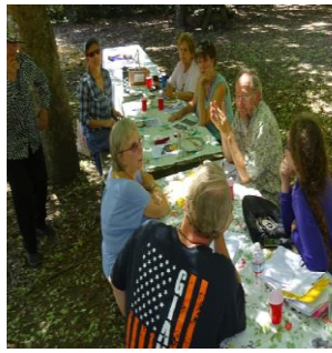
Informal meeting before eating