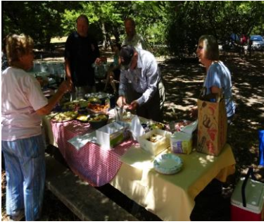
Preparing picnic event